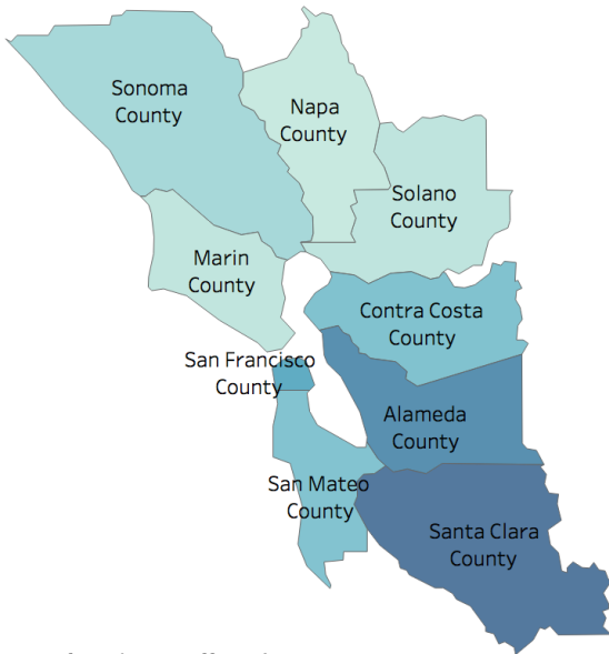
# of Employees Affected 15,000 160,700